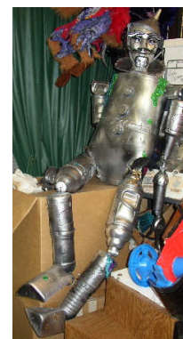
The Tin Man